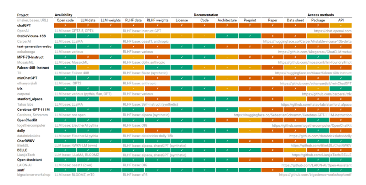
FIGURE 1 | How Open and Transparent Are 2023 Instruction-Following Text Generators?